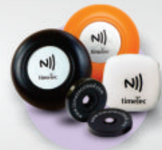
NFC Tags (Checkpoint)