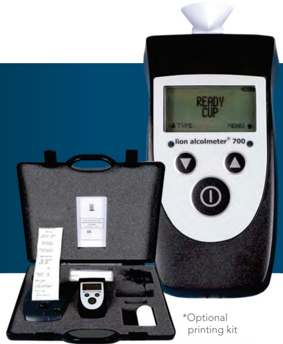
*Optional printing kit

The EBAB03 and its optional printer meet the very latest European standard EN 15964 for Police breathalyser testing. Meeting this specification ensures that it will remain accurate and reliable. It has multiple modes of operation, and also has the capability of recalling any of the older tests onto its screen for reviewing or reprinting.